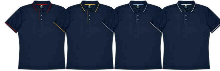
navy/red navy/gold navy/sky navy/white