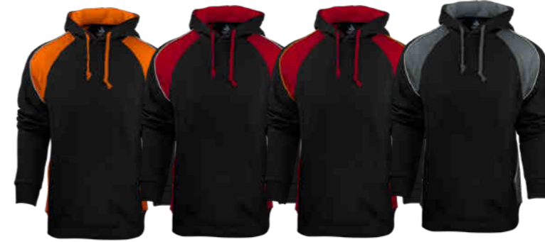
black/ electric orange/ white black/ red/ white black/ red/ gold black/ ashe/ white