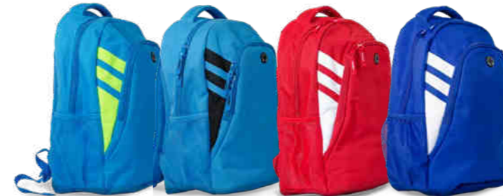
cyan/ neon green cyan/ black red/ white royal/ white