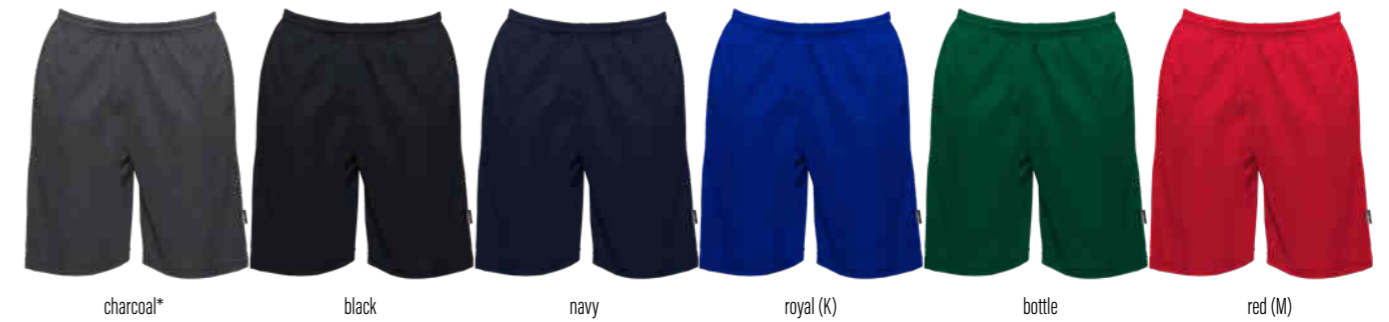
charcoal* black navy royal (K) bottle red (M)

(M) = mens only (K) = kids only *Charcoal not available in size 4