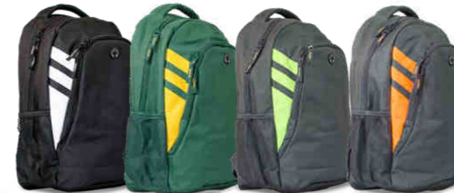
black/ white bottle/ gold slate/ neon green slate/ neon orange