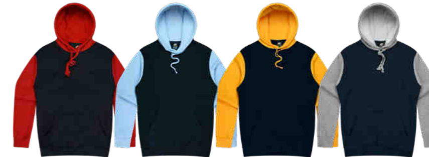
navy/red navy/sky navy/gold navy/grey