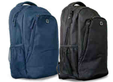
solid navy solid black