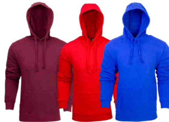
maroon red royal