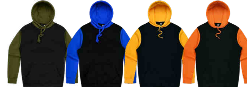
black/army green black/electric royal black/gold black/electric orange