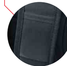
ID card holder