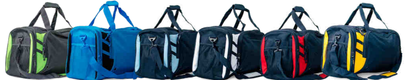
slate/ neon green