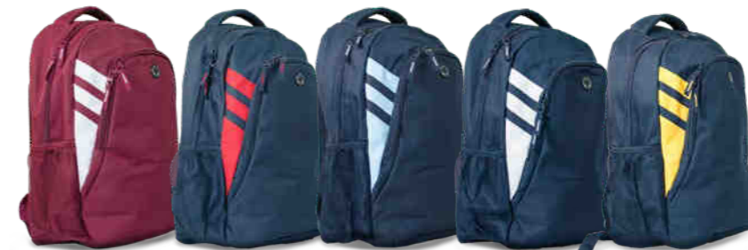
maroon/ white navy/ red navy/ sky navy/ white navy/ gold