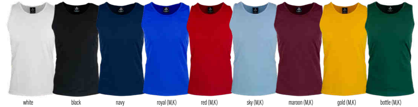
white black navy royal (M,K) red (M,K) sky (M,K) maroon (M,K) gold (M,K) bottle (M,K)