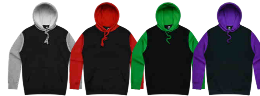
black/grey marle black/red black/kawa green black/electric purple