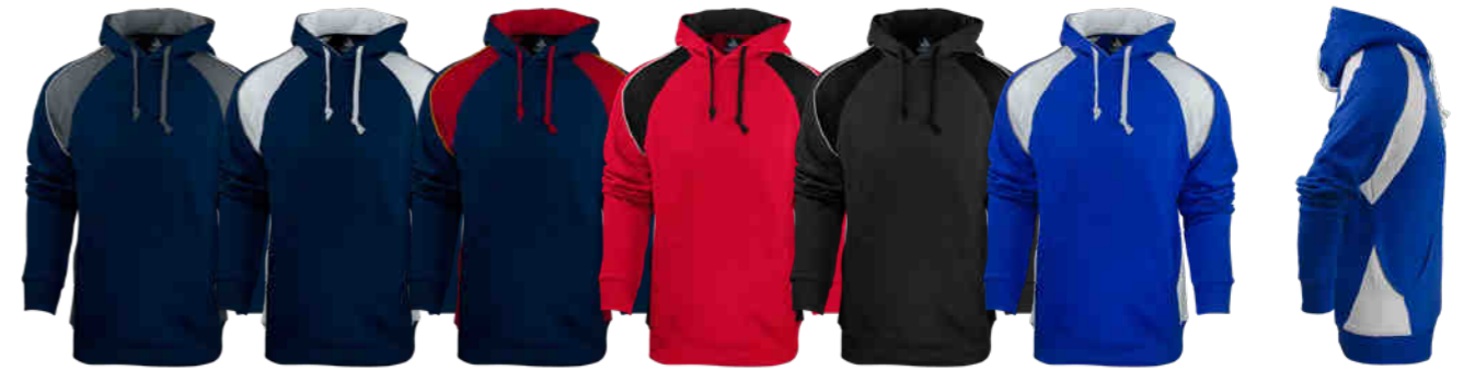
navy/ ashe/ white navy/ white/ ashe navy/ red/ gold red/ black/ white slate/ black/ white royal/ white/ ashe side view