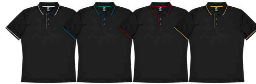
black/white black/teal black/red black/gold