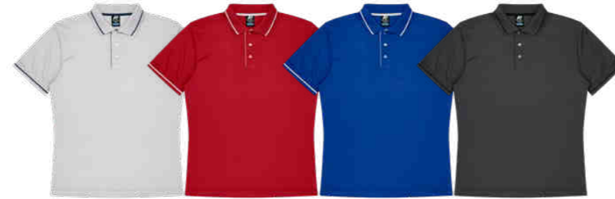
white/navy red/white royal/white slate/black