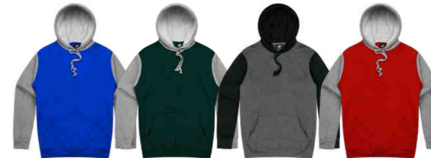
royal/grey bottle/grey charcoal/black red/grey