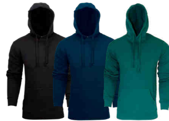
black navy bottle