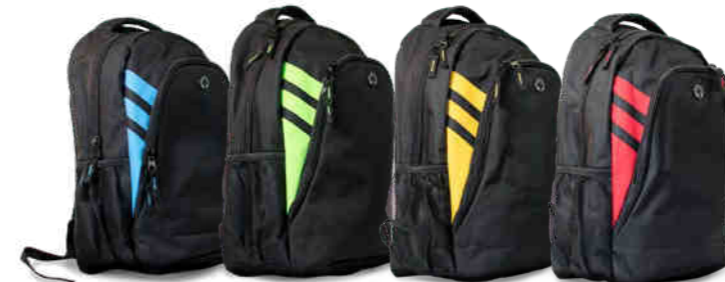
black/ cyan black/ neon green black/ gold black/ red