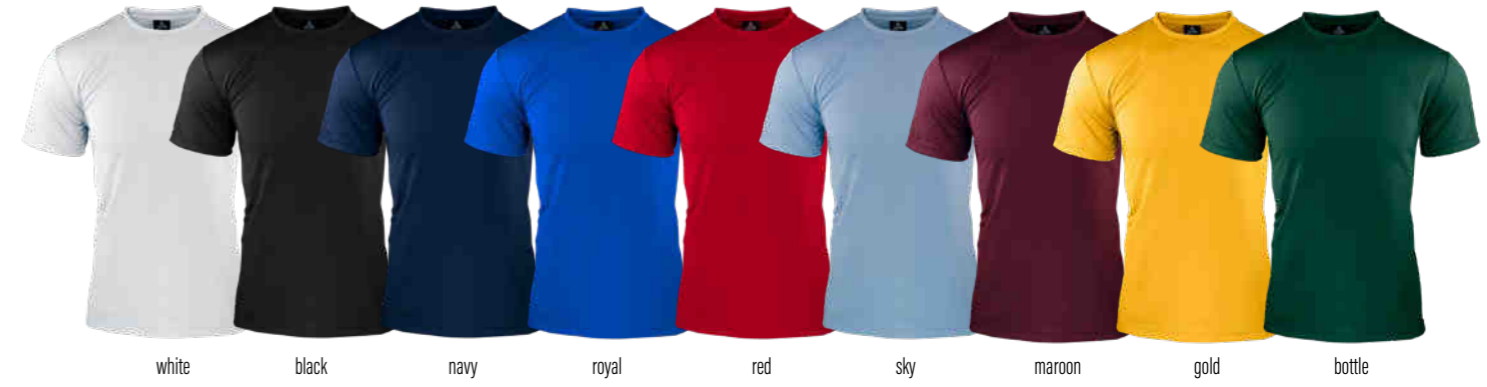
white black navy royal red sky maroon gold bottle