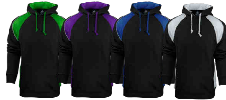
black/ kawa green/ white black/ electric purple/ white black/ electric royal/ white black/ white/ ashe