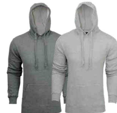
charcoal marle grey marle