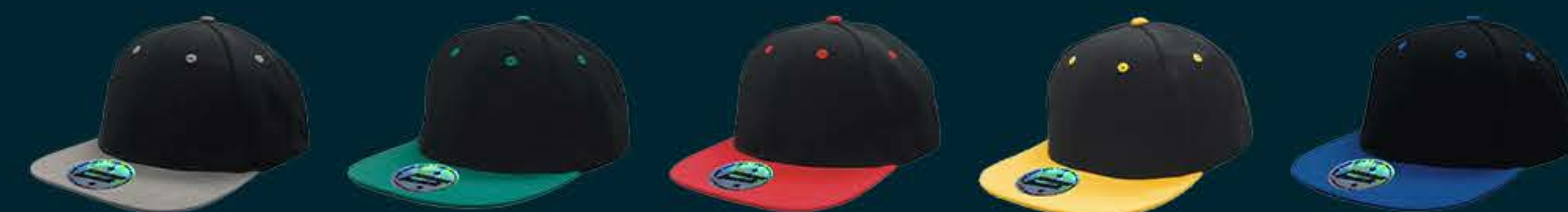
BLACK/CHARCOAL BLACK/EMERALD BLACK/RED BLACK/GOLD BLACK/ROYAL