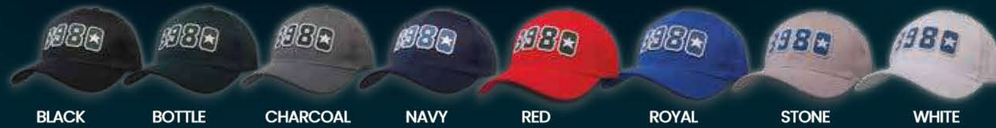
BLACK BOTTLE CHARCOAL NAVY RED ROYAL STONE WHITE