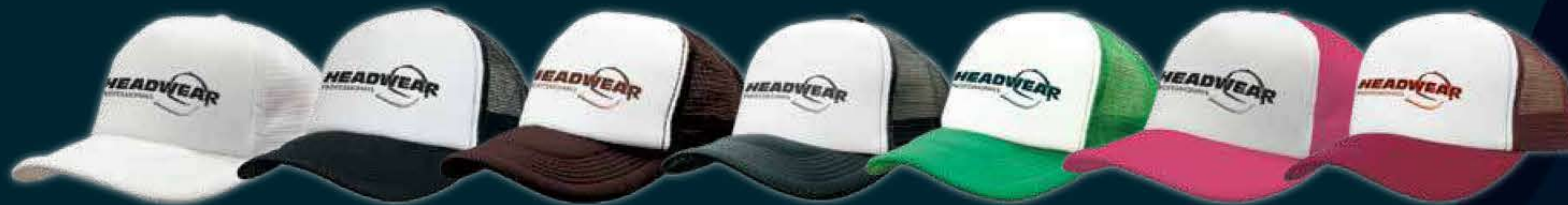
WHITE WHITE/BLACK WHITE/BROWN WHITE/CHARCOAL WHITE/EMERALD WHITE/HOT PINK WHITE/LIGHT PINK