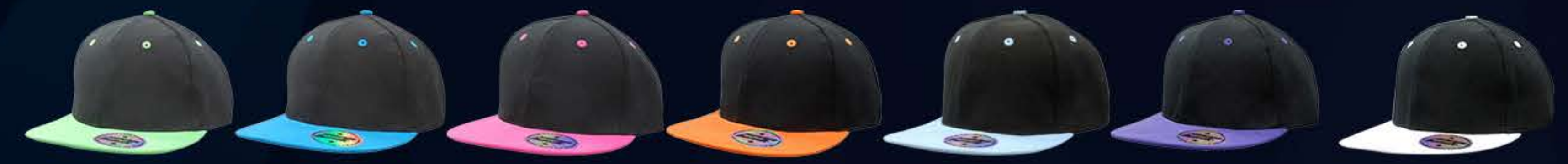
BLACK/BRIGHT GREEN BLACK/CYAN BLACK/HOT PINK BLACK/ORANGE BLACK/SKY BLACK/PURPLE BLACK/WHITE