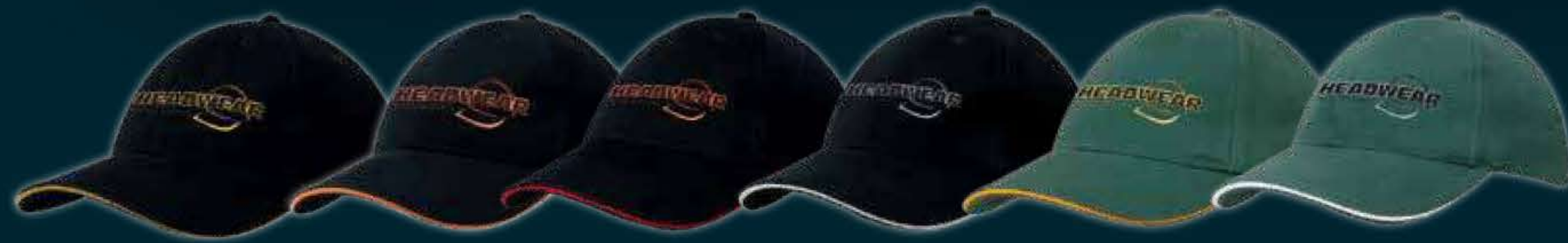
BLACK/GOLD BLACK/ORANGE BLACK/RED BLACK/WHITE BOTTLE/GOLD BOTTLE/WHITE