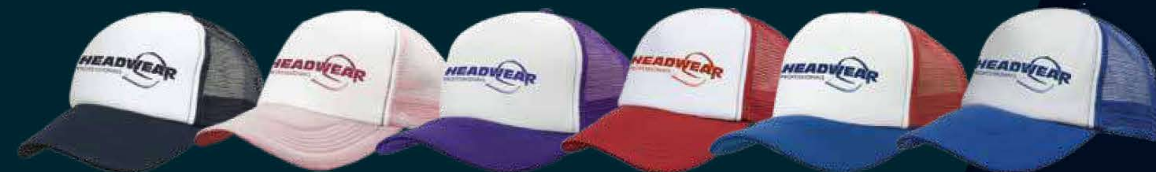
WHITE/MAROON WHITE/NAVY WHITE/PURPLE WHITE/RED WHITE/RED/ROYAL WHITE/ROYAL