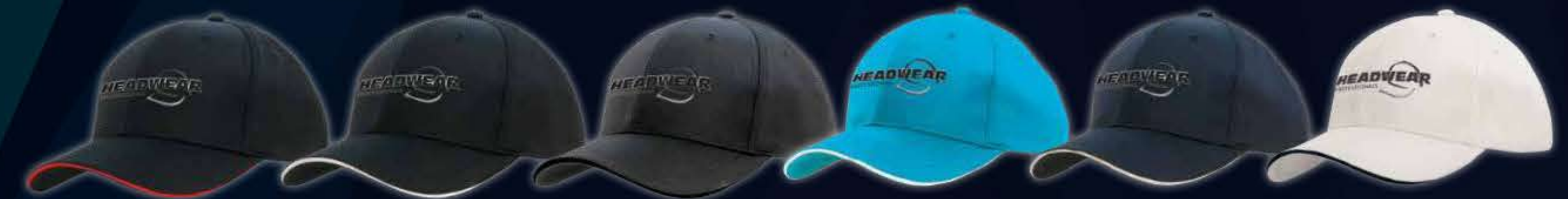
BLACK/RED BLACK/WHITE CHARCOAL/BLACK CYAN/WHITE NAVY/WHITE WHITE/NAVY