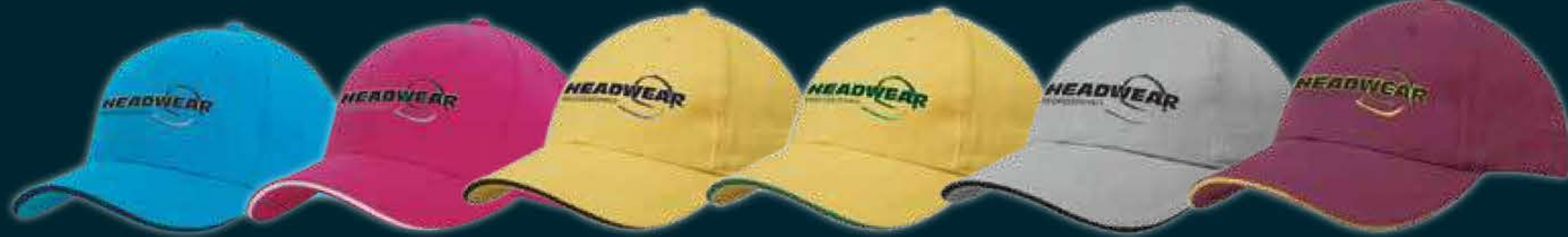
CYAN/NAVY HOT PINK/WHITE GOLD/BLACK GOLD/BOTTLE GREY/BLACK MAROON/GOLD