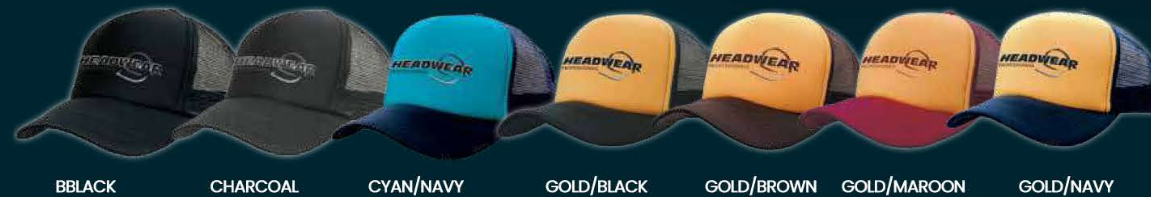
BBLACK CHARCOAL CYAN/NAVY GOLD/BLACK GOLD/BROWN GOLD/MAROON GOLD/NAVY