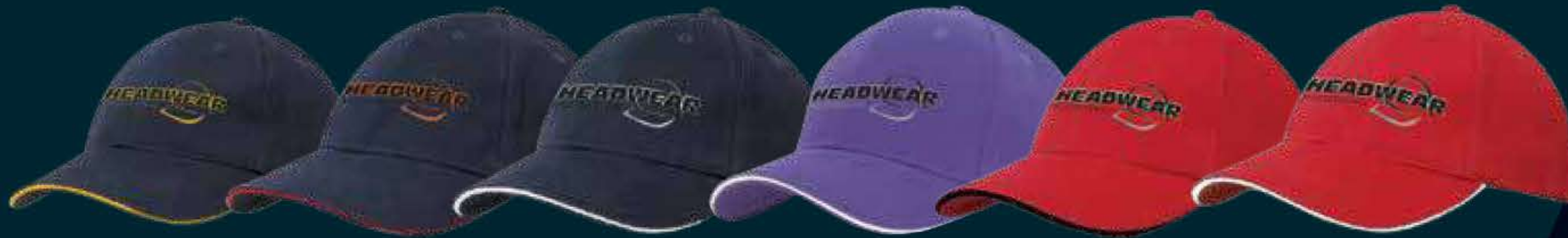
NAVY/GOLD NAVY/RED NAVY/WHITE PURPLE/WHITE RED/BLACK RED/WHITE