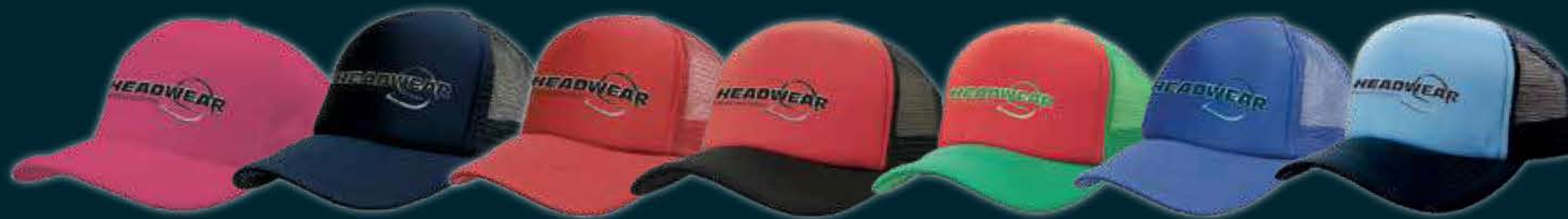
HOT PINK NAVY RED RED/BLACK RED/EMERALD ROYAL SKY/NAVY