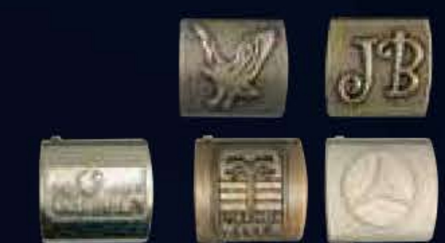
EXAMPLES OF EMBOSSED BUCKLES