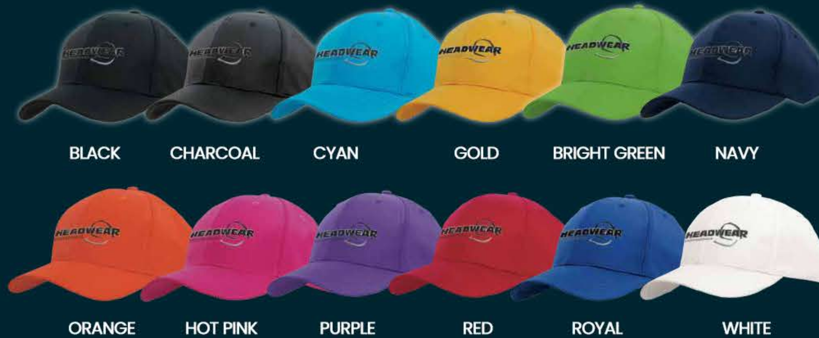
BLACK CHARCOAL CYAN GOLD BRIGHT GREEN NAVY