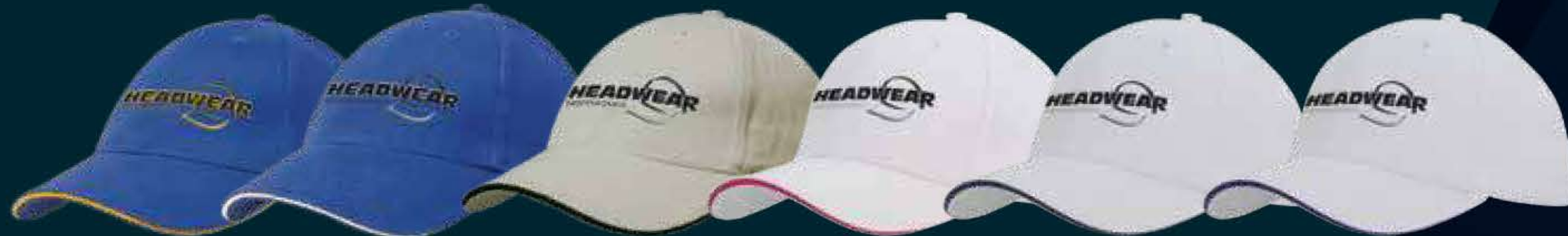
ROYAL/GOLD ROYAL/WHITE STONE/NAVY WHITE/HOT PINK WHITE/NAVY WHITE/PURPLE