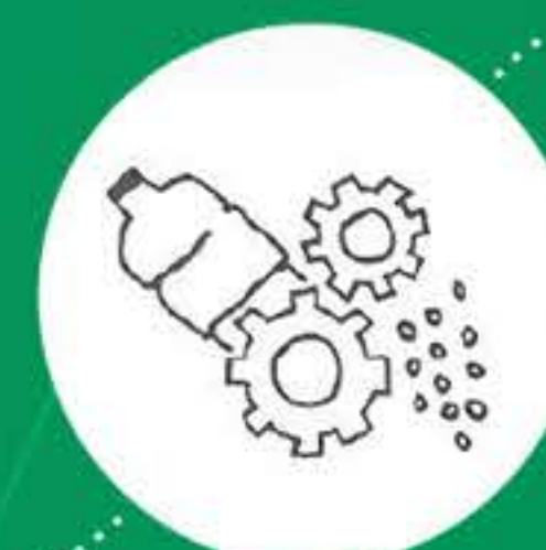
Selection & grinding