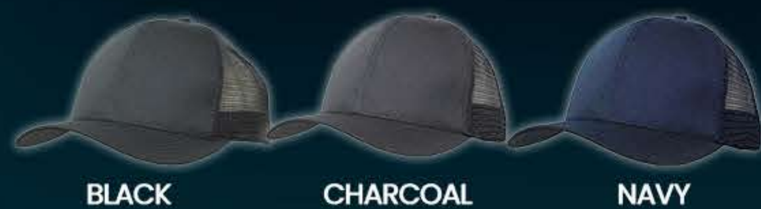
BLACK CHARCOAL NAVY